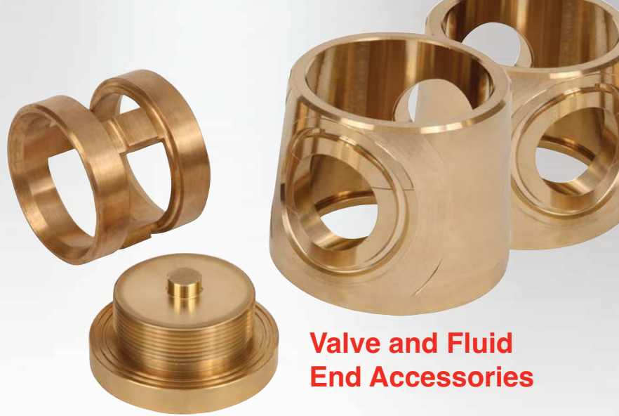
Valve and Fluid End Accessories

Randall has been very successful in developing and maintaining a loyal customer base ... and it's more than our ability to excel at "quality, pricing and delivery." We can establish an inventory management relationship that reduces your lead time from several weeks to a few days.