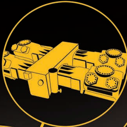
Natural Gas Compressor