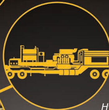
Hydraulic Fractionating Pump