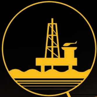
Offshore Deep Well Drilling