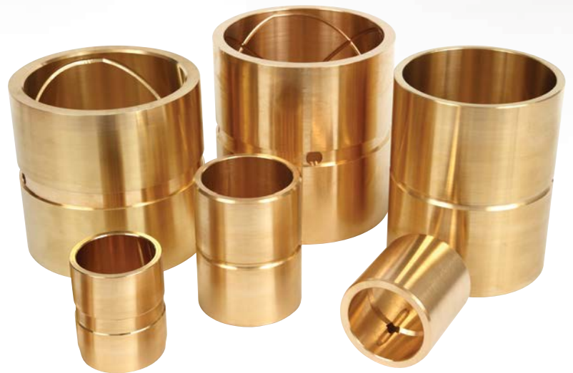
Wrist Pin Bushings and Connecting Rod Bushings