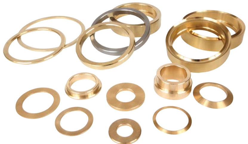
Stuffing Box, Throat Bushing, Adapter Rings and Spacers