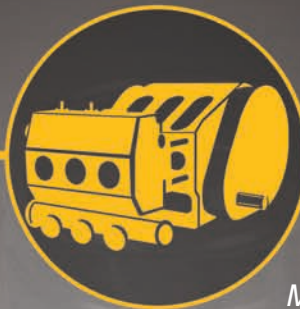
Mud Pump Stimulation Pump